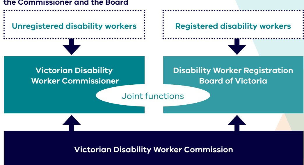
Figure 1: Interrelationships between the Commission, the Commissioner and the Board

Figure 1 illustrates the interrelationships between the roles of the Commission, the Commissioner and the Board.